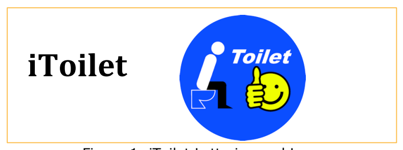
Figure 1: iToilet Lettering and Logo

For a common appearance of the project, an initial Corporate Identity (CI) including Lettering/Logo and Templates (for internal, external documents and presentations) has been created. The simple logo tries to sketch the purpose of the project and to link between the project name and work topic.