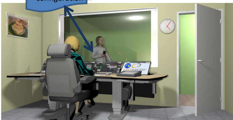
Nurses' room with care documentation

The business model aims at a modular product with scalability and customisation of the functionality and services according to the individual customer's needs and wishes.